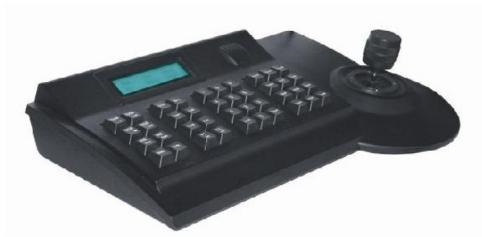
AKB300 3 Axis RS485 Control Keyboard