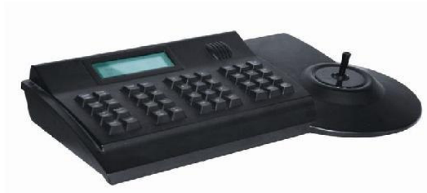
AKB200 2 Axis RS485 Control Keyboard